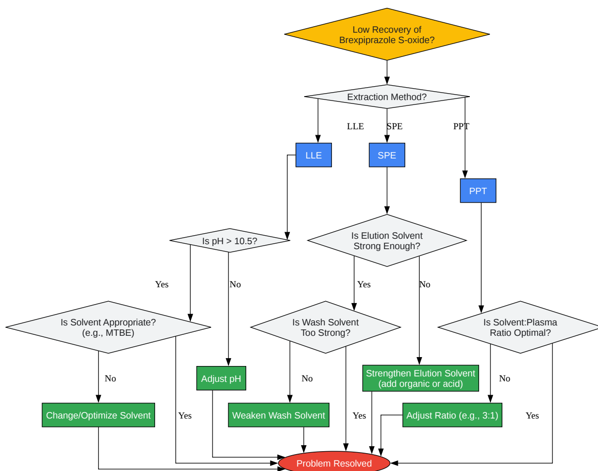
Caption: Solid-Phase Extraction (SPE) Workflow.

Click to download full resolution via product page