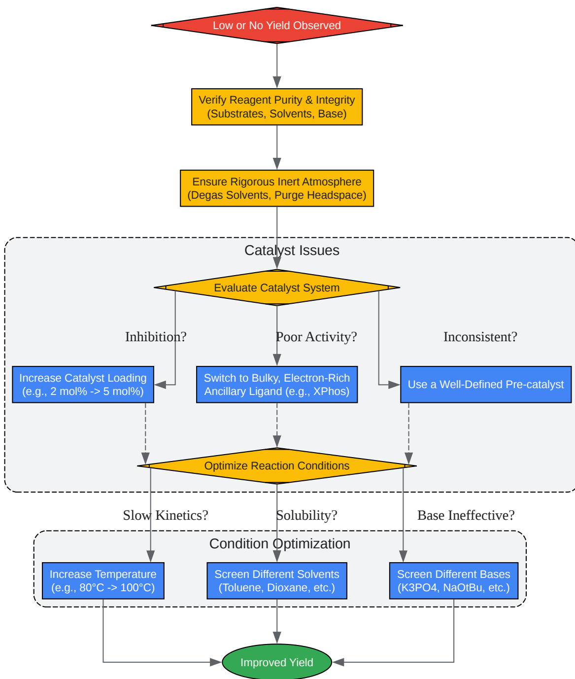
Troubleshooting Workflow for Low Reaction Yield

Click to download full resolution via product page