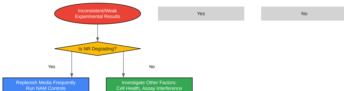
Caption: Workflow for Assessing NR Malate Stability.

Click to download full resolution via product page