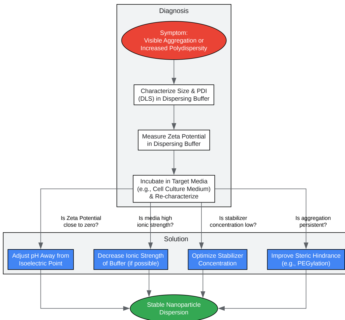
Workflow: Diagnosing &amp; Resolving Nanoparticle Aggregation

Click to download full resolution via product page