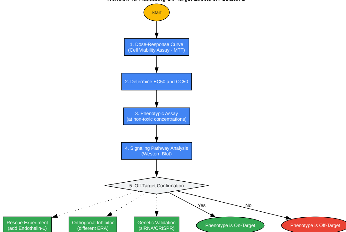
Workflow for Assessing Off-Target Effects of Aselacin B