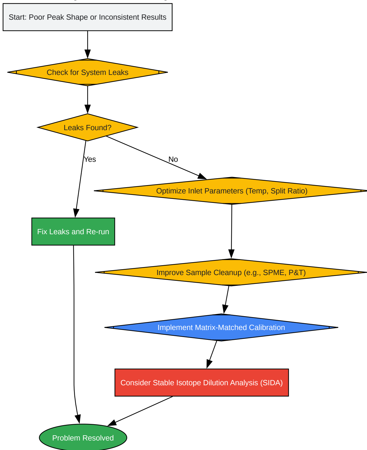
Figure 2. Troubleshooting Workflow for Poor GC/MS Results

Click to download full resolution via product page