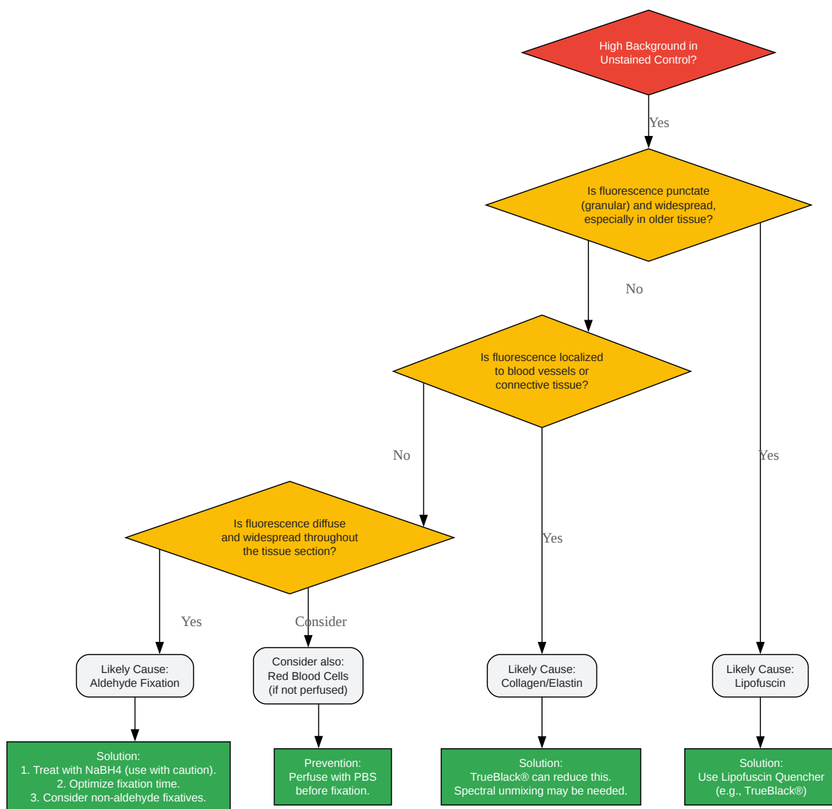
Troubleshooting Workflow for High Autofluorescence

Click to download full resolution via product page