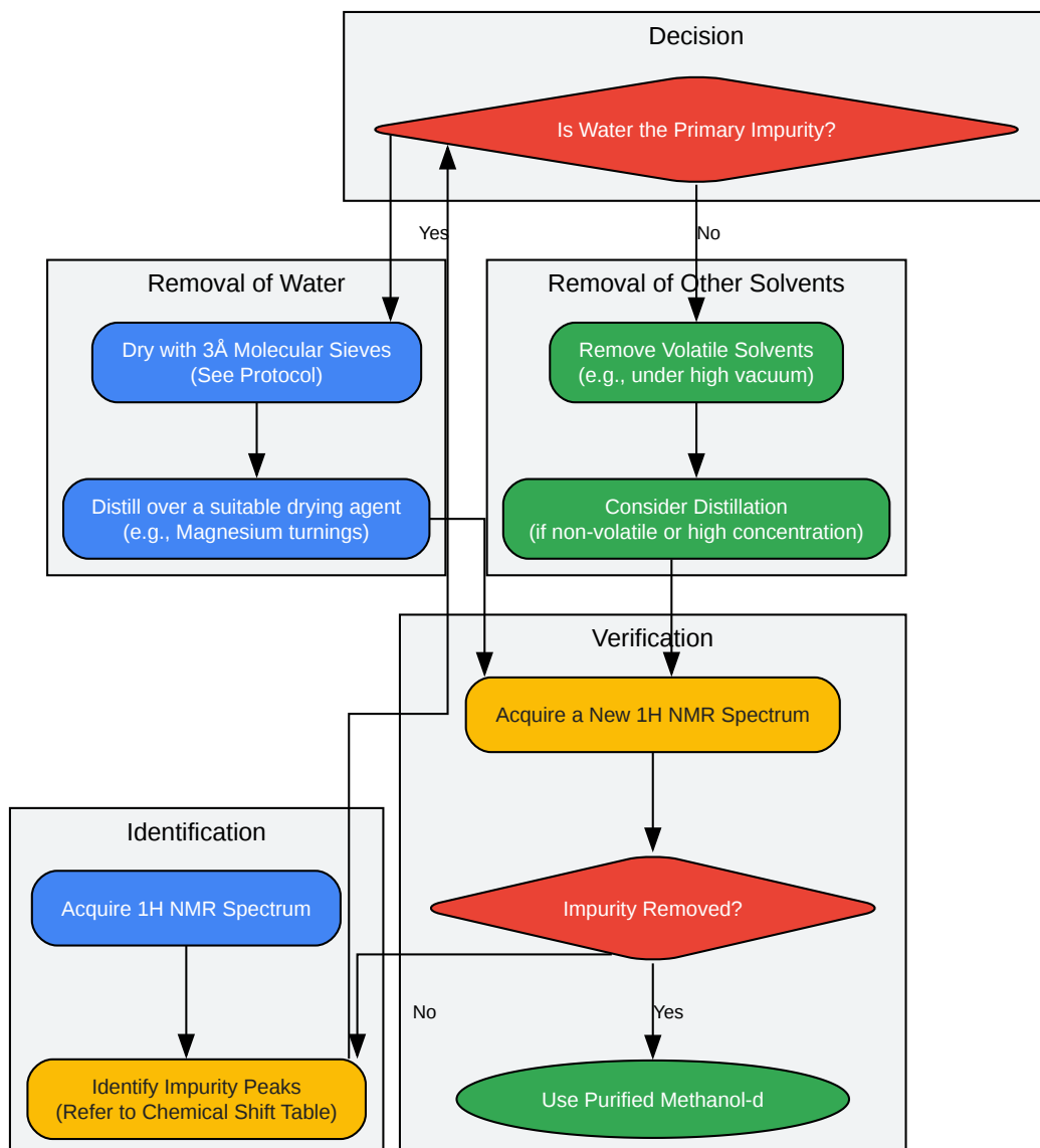
Workflow for Troubleshooting Methanol-d Impurities

Click to download full resolution via product page