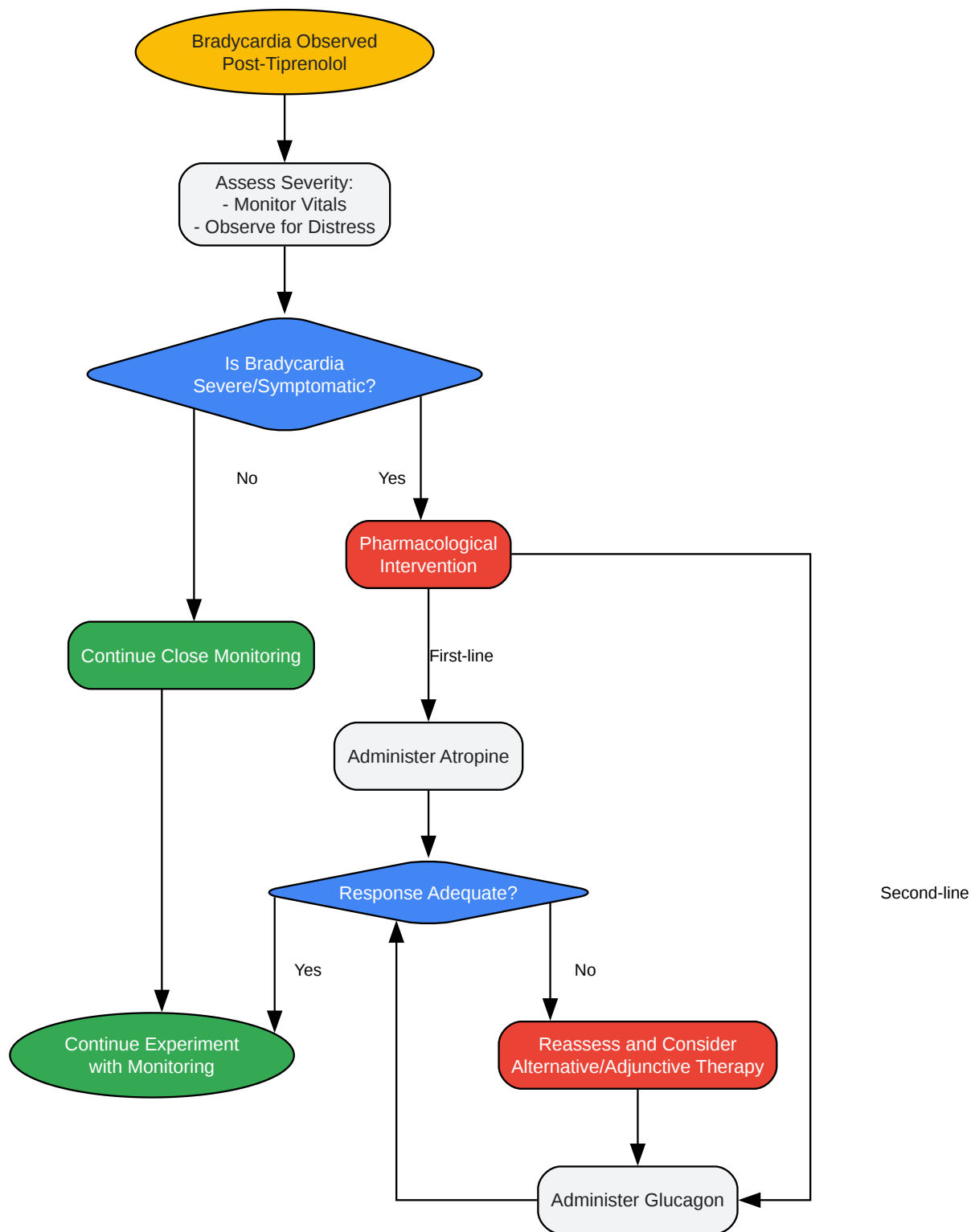
Caption: Signaling pathway of tiprenolol -induced bradycardia.

Click to download full resolution via product page