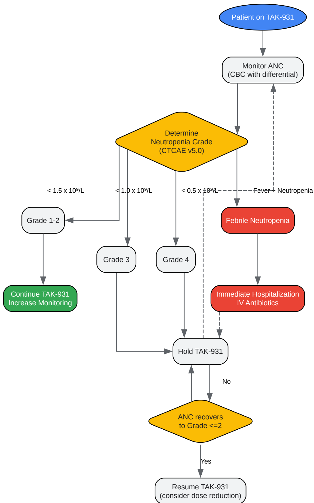
Caption: CDC7 signaling pathway and the mechanism of action of TAK-931.

Click to download full resolution via product page