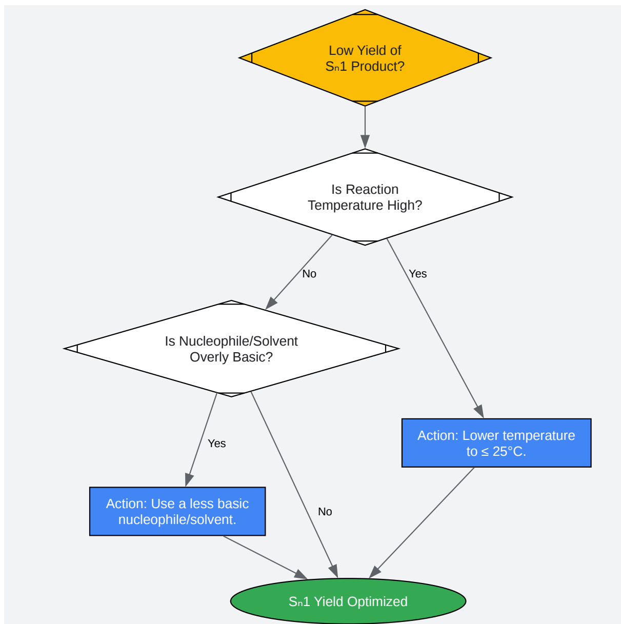
Diagram 2: Troubleshooting Workflow for Low S_N1 Yield

Click to download full resolution via product page