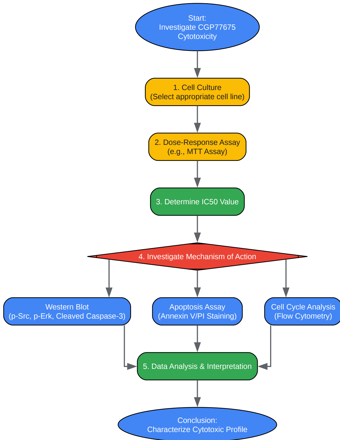
Diagram 2: Experimental Workflow for Investigating CGP77675 Hydrate-Induced Cytotoxicity

Click to download full resolution via product page