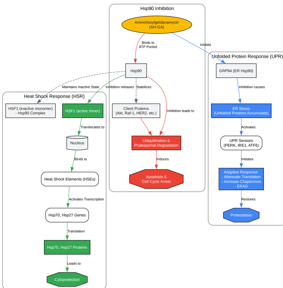
AH-GA Mechanism of Action and Cellular Responses

Click to download full resolution via product page