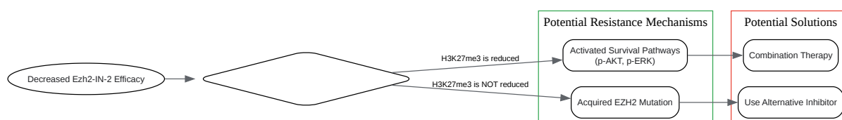
Caption: Signaling pathways involved in resistance to EZH2 inhibition.

Click to download full resolution via product page