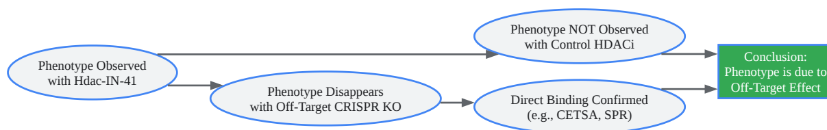
Caption: On-Target vs. Potential Off-Target Signaling.

Click to download full resolution via product page