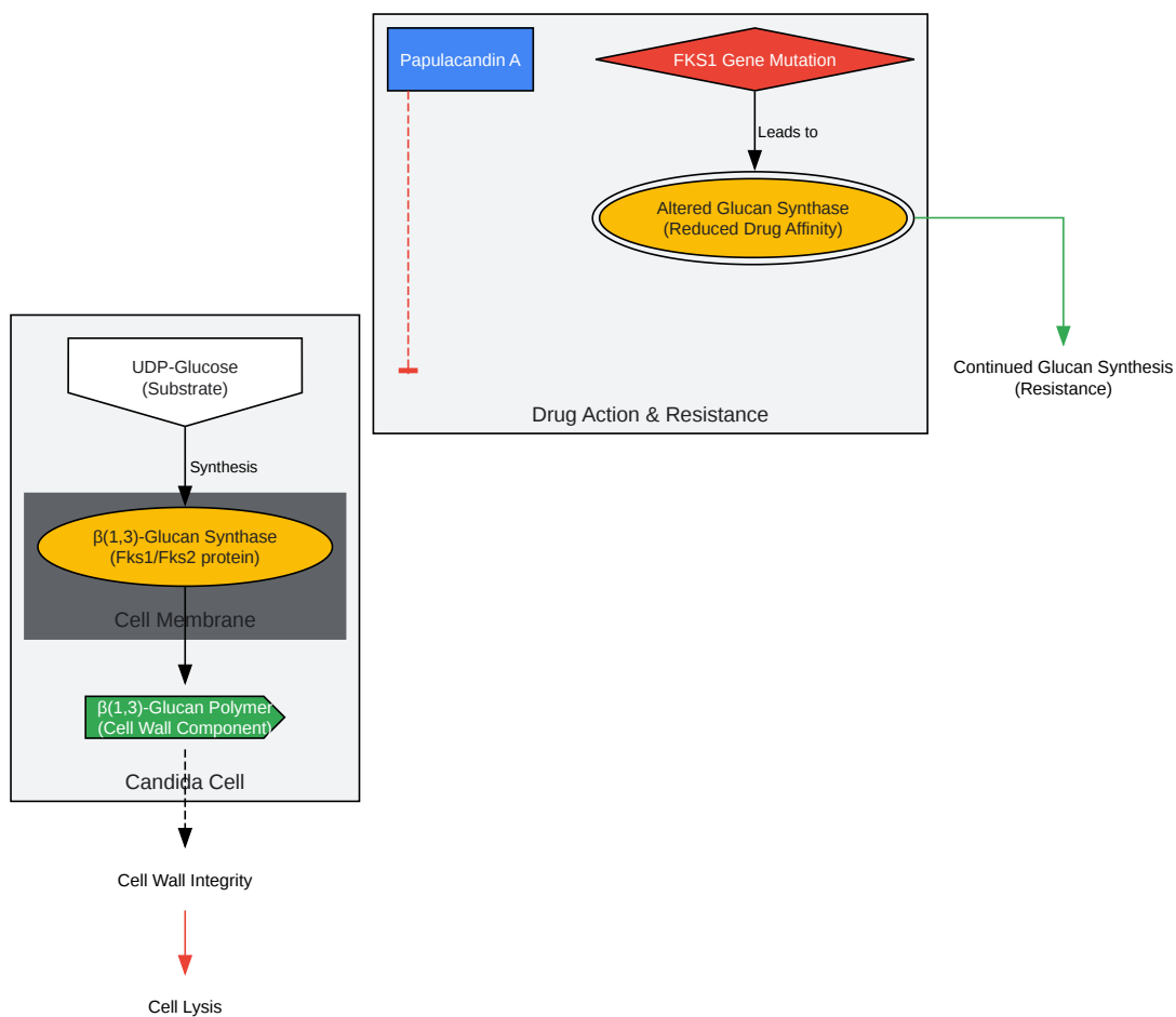
Mechanism of Papulacandin A Action and Resistance

Click to download full resolution via product page