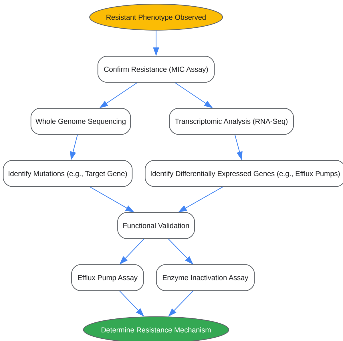
Diagram 2: Experimental Workflow for Investigating Resistance

Click to download full resolution via product page