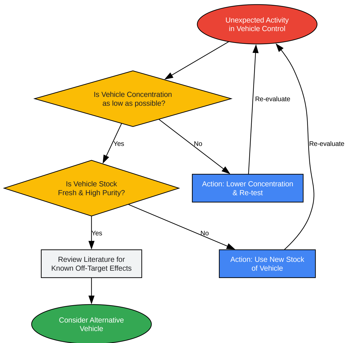
Troubleshooting Unexpected Vehicle Control Activity

Click to download full resolution via product page