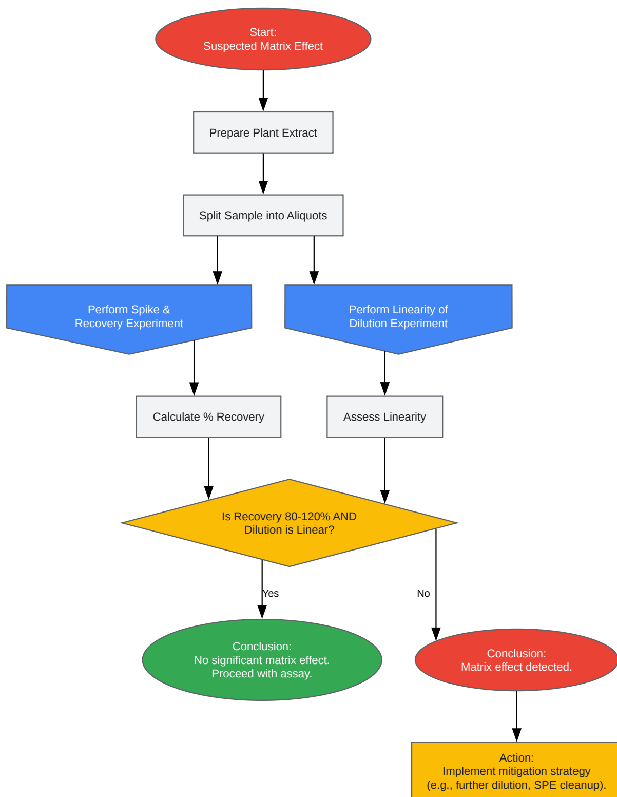
Diagram 2: Experimental Workflow for Identifying Matrix Effects