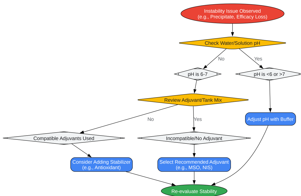
Fig 1. Workflow for Cyprosulfamide Stability Testing.

Click to download full resolution via product page