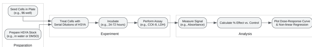
Figure 1: Standard In Vitro Dose-Response Workflow

Click to download full resolution via product page