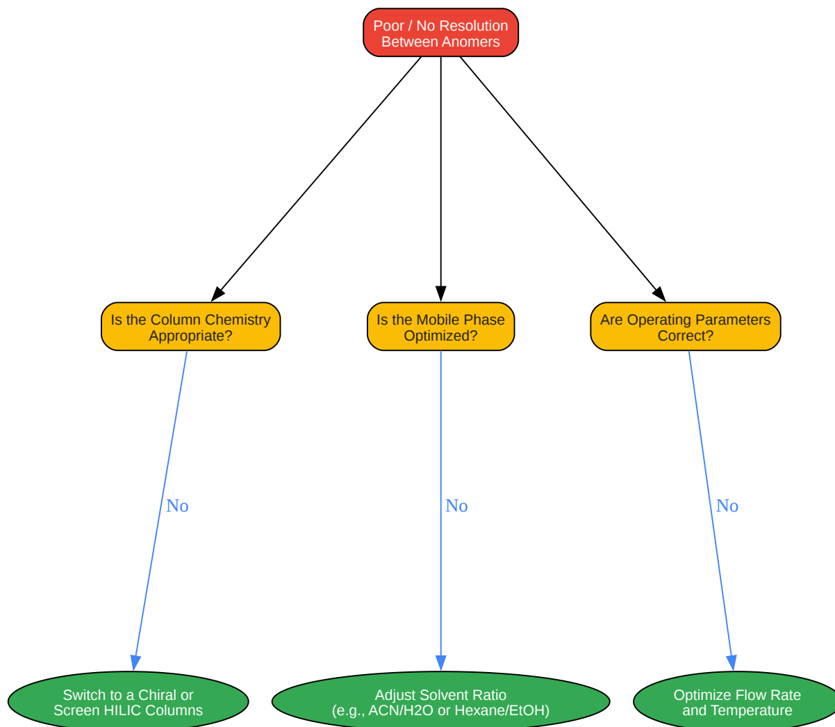
Troubleshooting Workflow for Anomer Separation

Click to download full resolution via product page