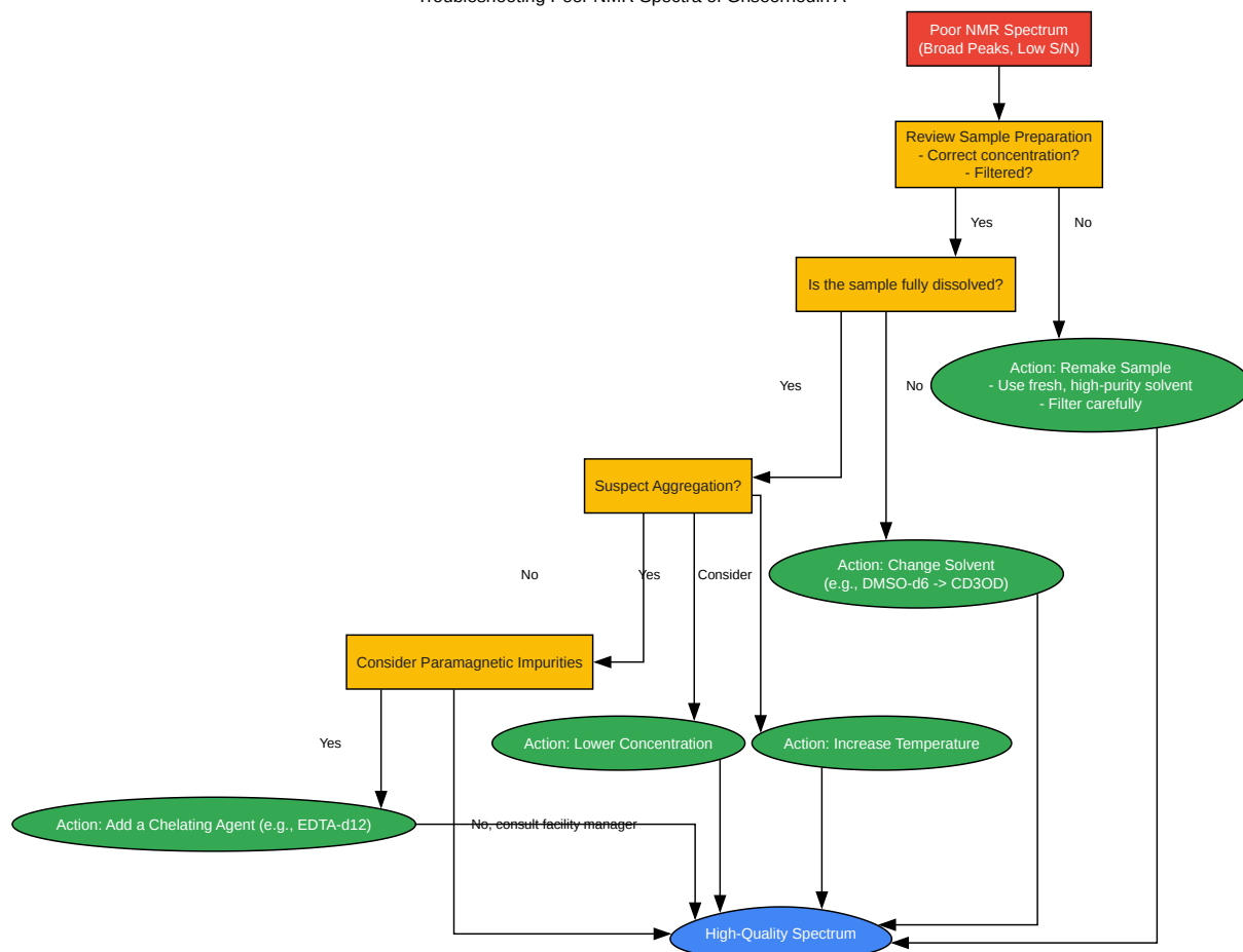
Troubleshooting Poor NMR Spectra of Griseorhodin A

Click to download full resolution via product page