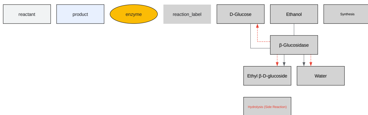
Fig. 1: Ethyl Glucoside Synthesis Pathway

Click to download full resolution via product page