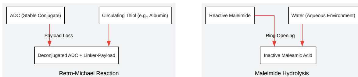
Figure 1. Mechanisms of Maleimide Instability.

Below are diagrams illustrating key concepts related to MC-VC-PABC linker stability and modification.