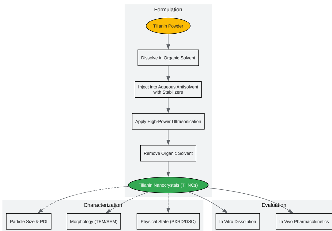
Experimental Workflow for Tilianin Nanocrystal Formulation and Evaluation

Click to download full resolution via product page