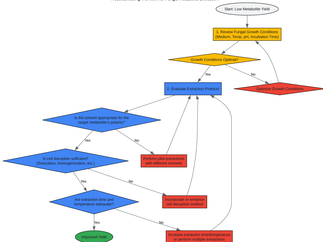
Troubleshooting Workflow for Fungal Metabolite Extraction

Click to download full resolution via product page