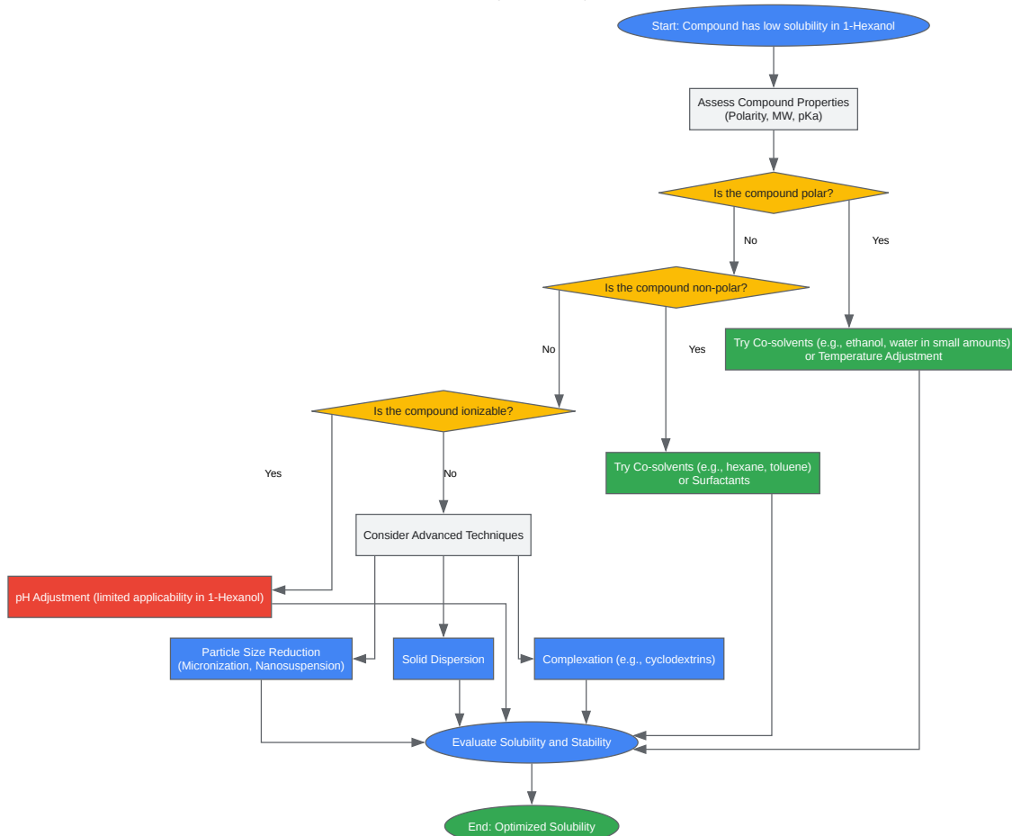
Workflow for Addressing Low Solubility in 1-Hexanol

Click to download full resolution via product page