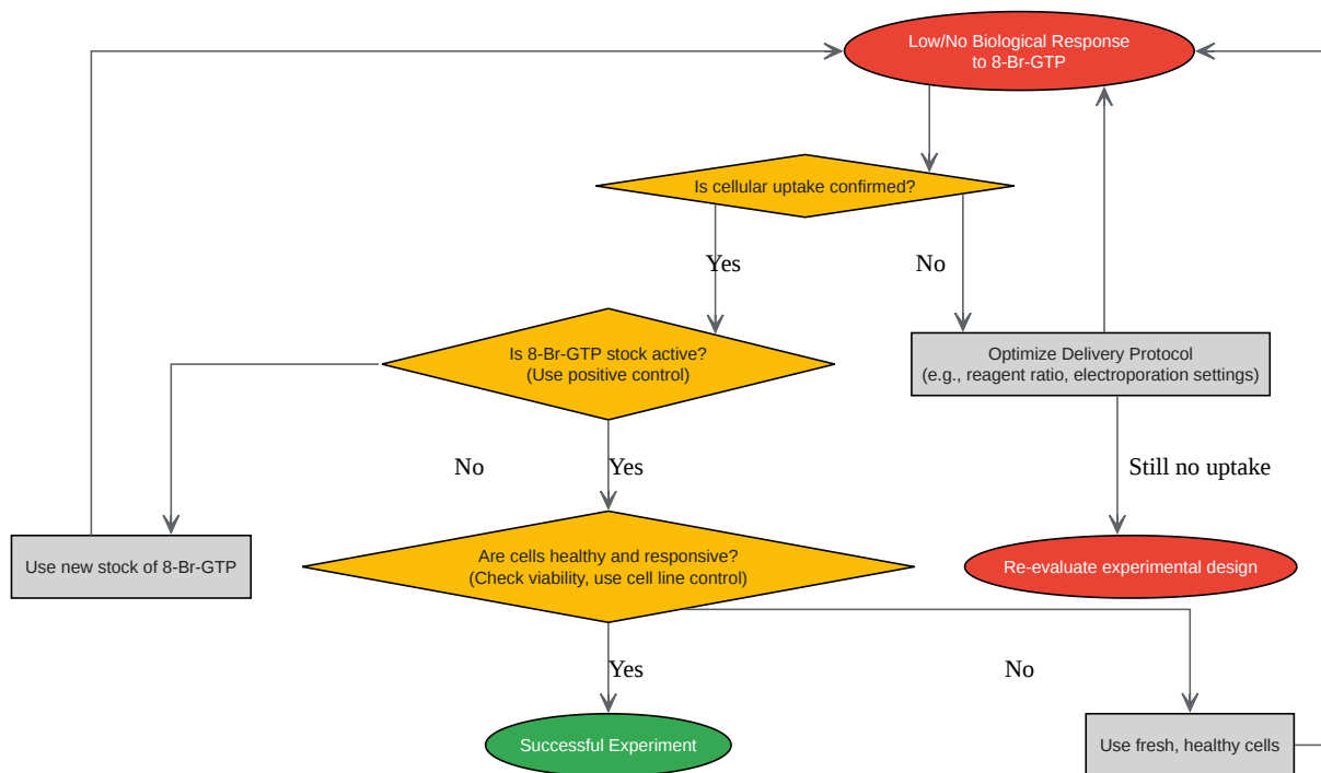
Caption: General experimental workflow for intracellular delivery of 8-Br-GTP .

Click to download full resolution via product page