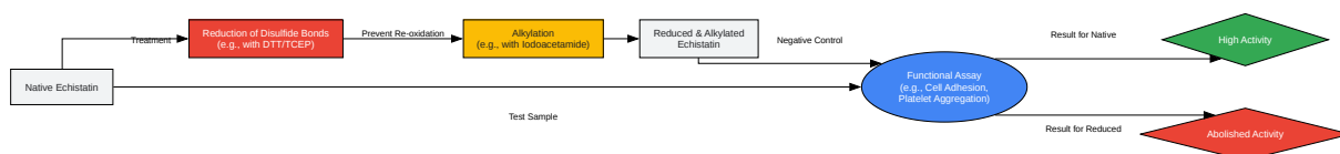
Diagram 1: Experimental Workflow for Assessing the Impact of Disulfide Bond Reduction

Click to download full resolution via product page