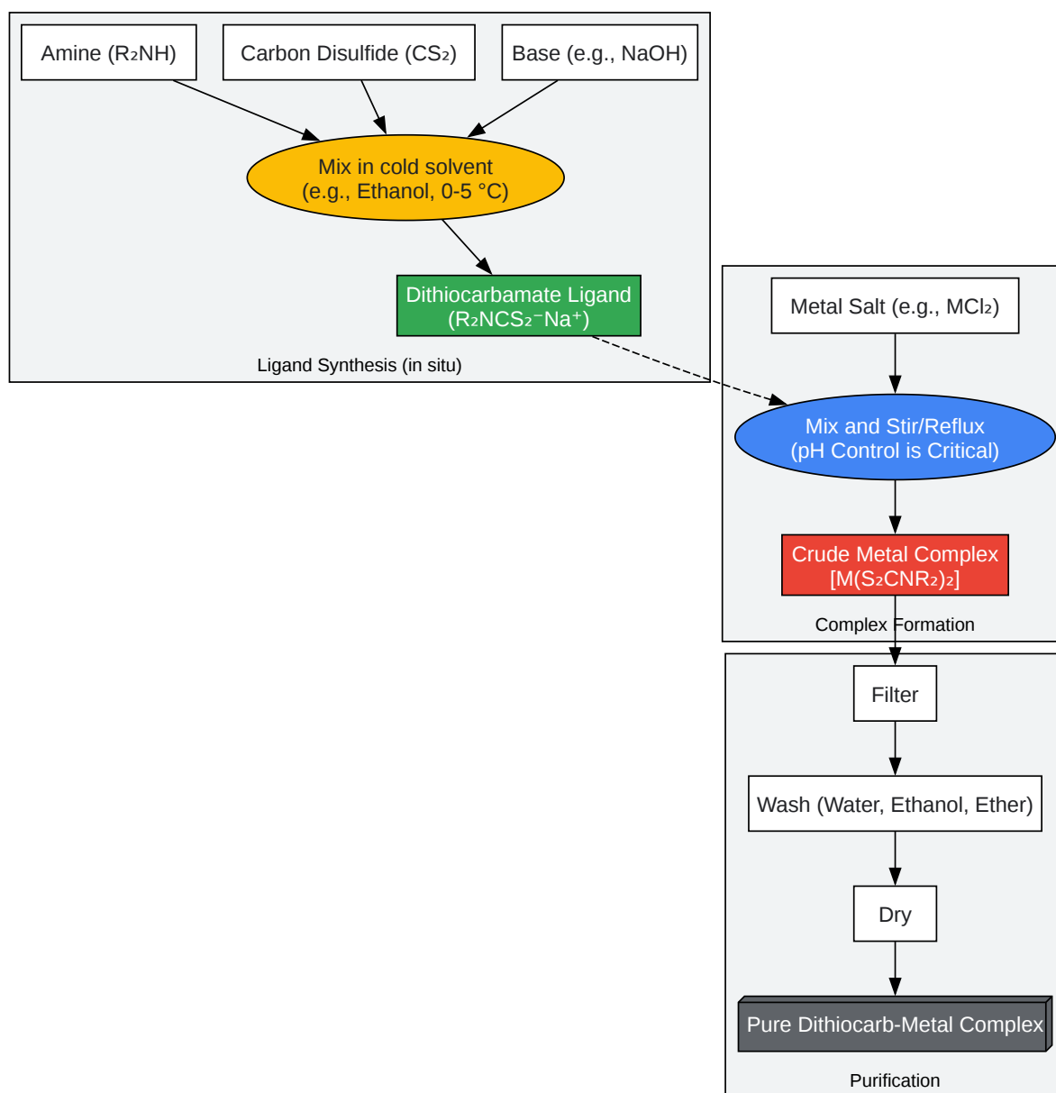
Diagram 1: General Experimental Workflow for Dithiocarb-Metal Complex Synthesis

Click to download full resolution via product page