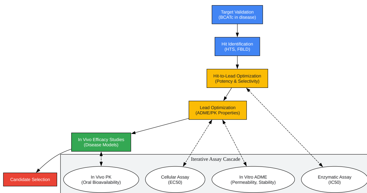
Caption: BCAA catabolism pathway showing cytosolic (BCATc) and mitochondrial (BCATm) transamination.

Click to download full resolution via product page