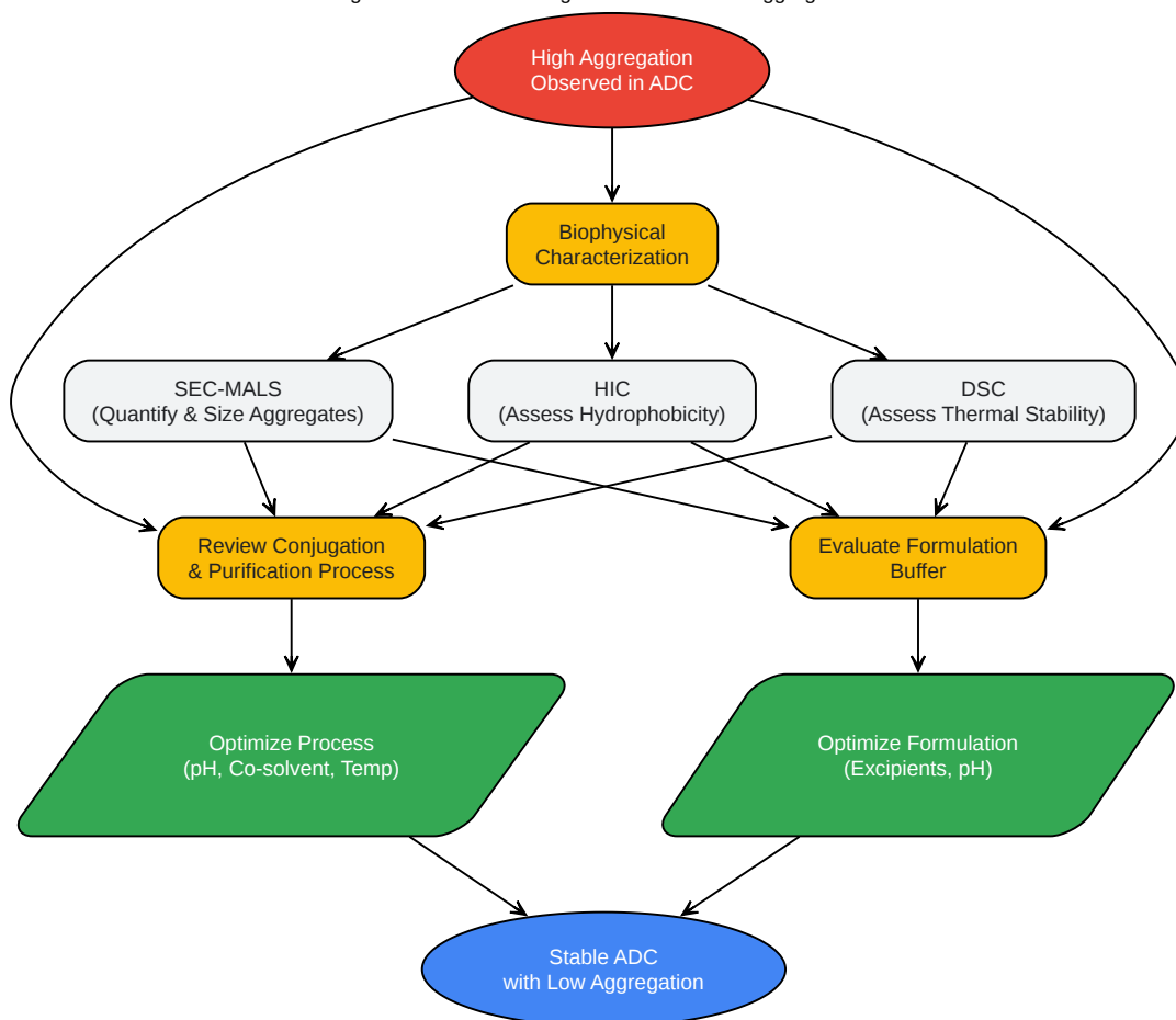
Figure 2. Troubleshooting Workflow for ADC Aggregation

Click to download full resolution via product page