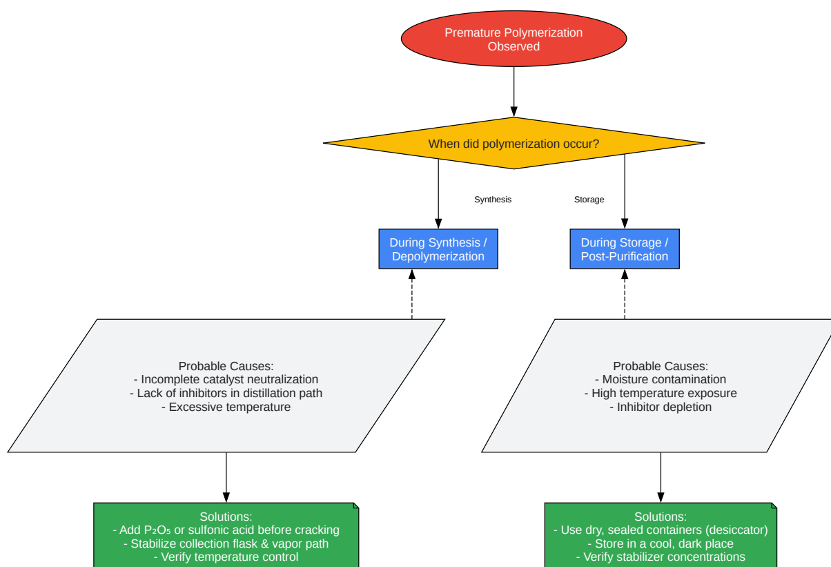
Figure 1. Troubleshooting Logic for Premature Polymerization

Click to download full resolution via product page