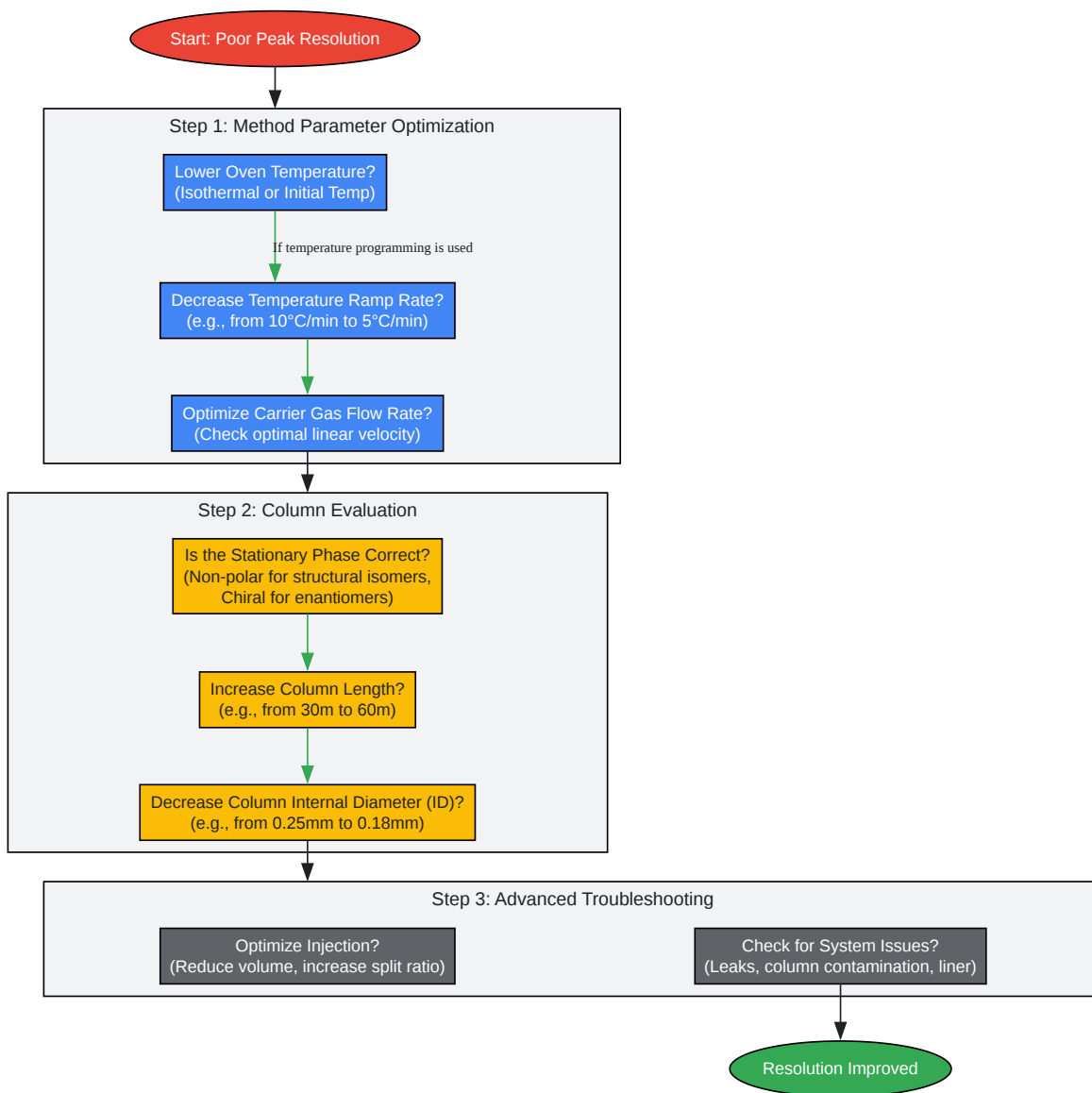
Troubleshooting Workflow for Poor Peak Resolution

Click to download full resolution via product page