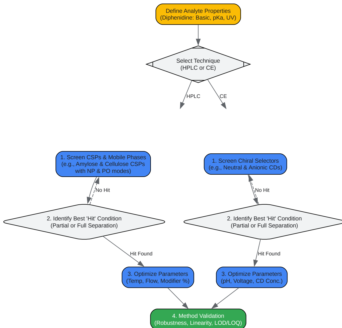
Figure 2: General Workflow for Chiral Method Development

Click to download full resolution via product page