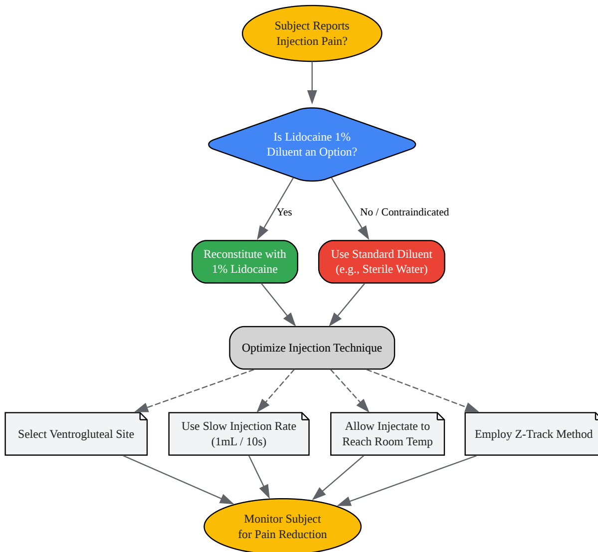
Decision Tree for Minimizing Cefamandole IM Injection Pain

Click to download full resolution via product page