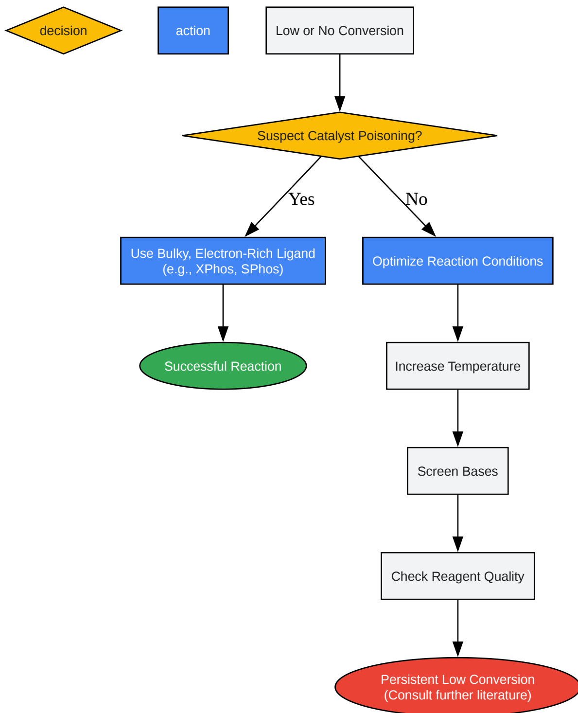
Diagram 2: Experimental Workflow for Troubleshooting Low Conversion

Caption: Coordination of the pyridine substrate to the active Pd(0) catalyst leads to an inactive complex, halting the catalytic cycle.