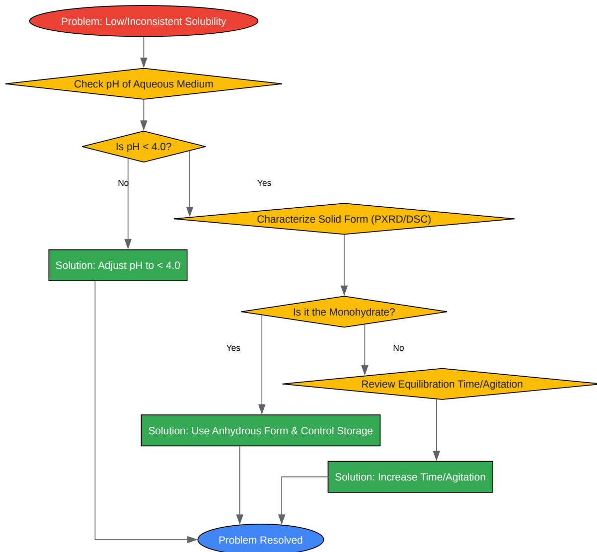
Caption: Workflow for Determining Saturation Solubility.

Click to download full resolution via product page