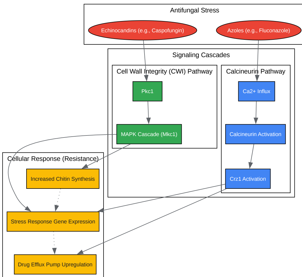
Key Signaling Pathways in Antifungal Drug Resistance

Click to download full resolution via product page