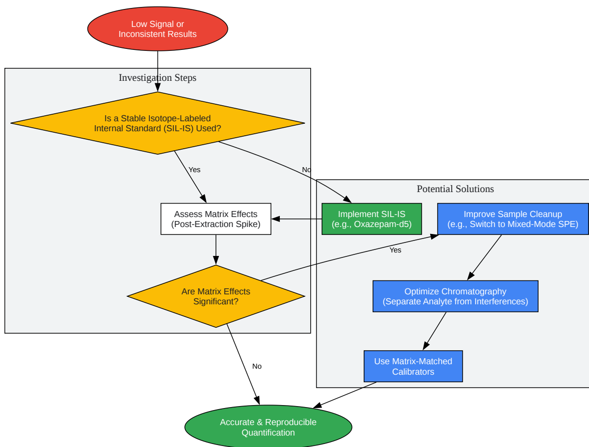
Caption: Workflow for sample preparation and mixed-mode SPE.

Click to download full resolution via product page