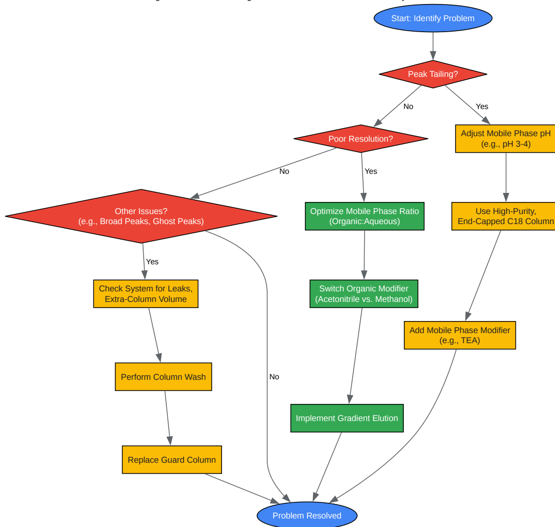
Figure 2. Troubleshooting Flowchart for Meloxicam HPLC Analysis

Click to download full resolution via product page