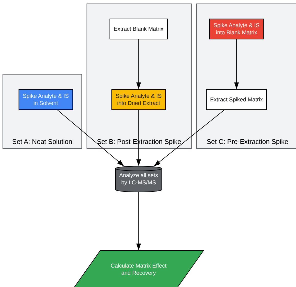
Workflow for Matrix Effect Evaluation

Click to download full resolution via product page