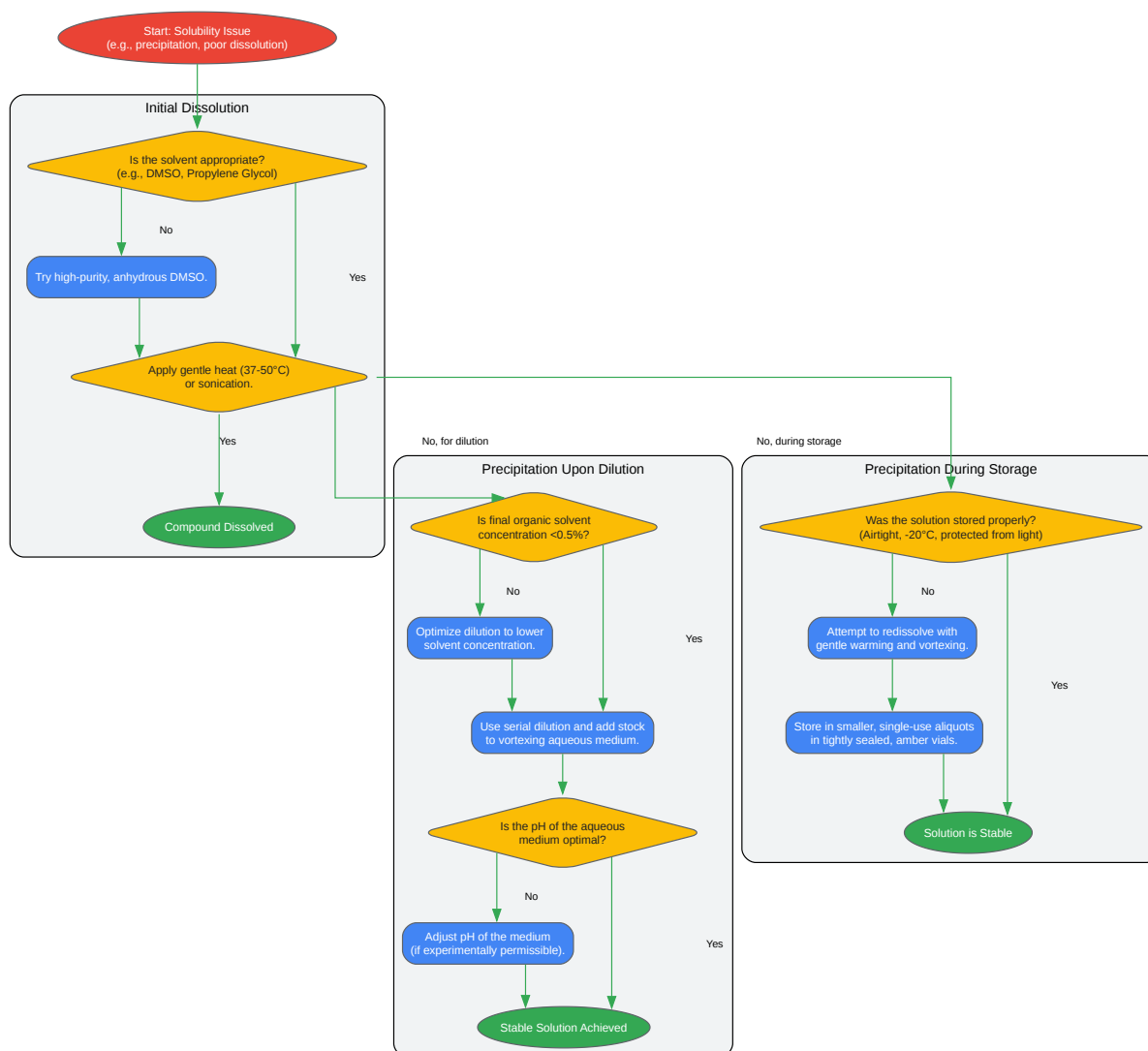
Troubleshooting Workflow for Solubility Issues

Click to download full resolution via product page