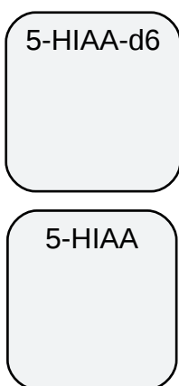
Chemical Structures of 5-HIAA and 5-HIAA-d6

Click to download full resolution via product page