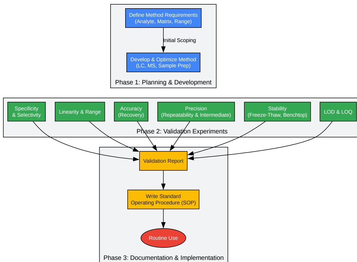
Figure 1: General Analytical Method Validation Workflow

This diagram outlines the key stages in a typical analytical method validation process, from initial planning to final implementation.