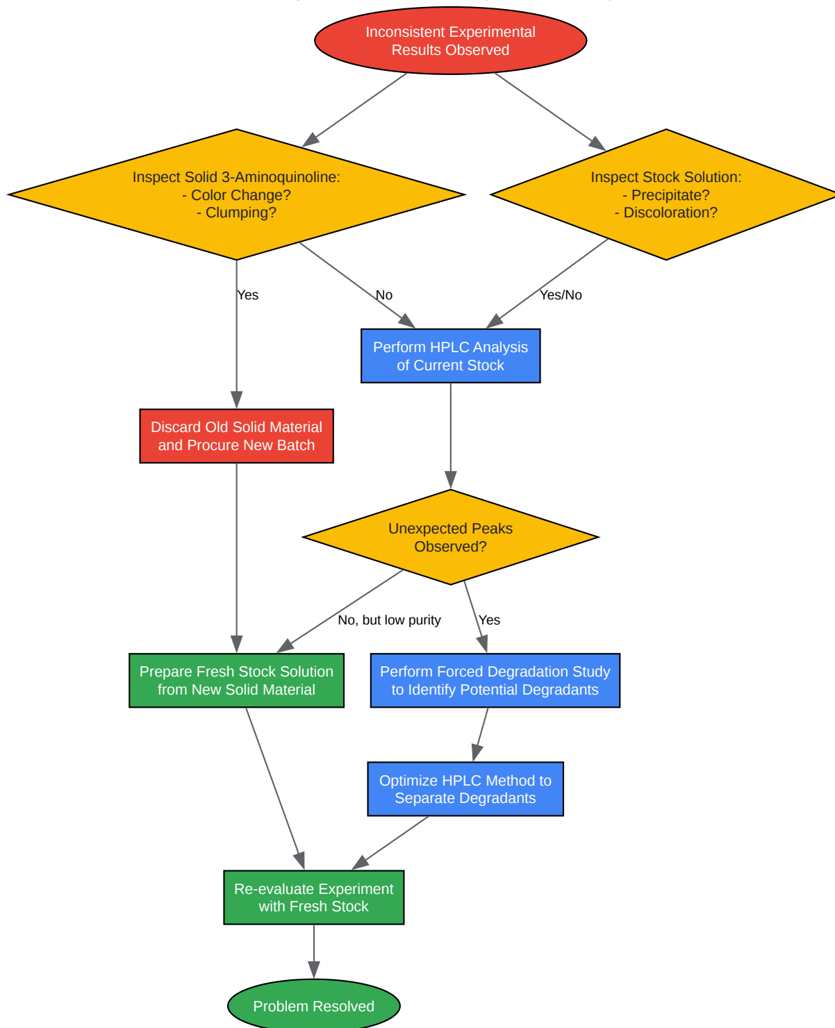
Troubleshooting Workflow for 3-Aminoquinoline Stability Issues

Click to download full resolution via product page