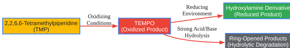
Caption: Workflow for Forced Degradation Study of TMP.

Click to download full resolution via product page