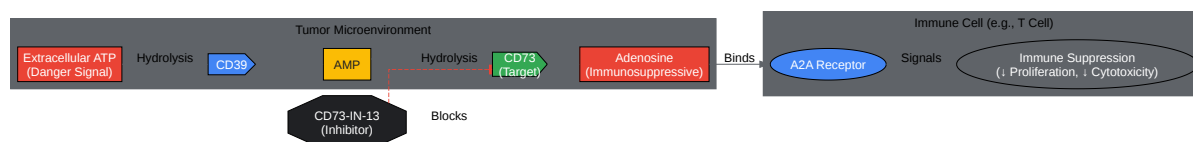
Diagram 1: The CD73-Adenosine Immunosuppressive Pathway

Click to download full resolution via product page