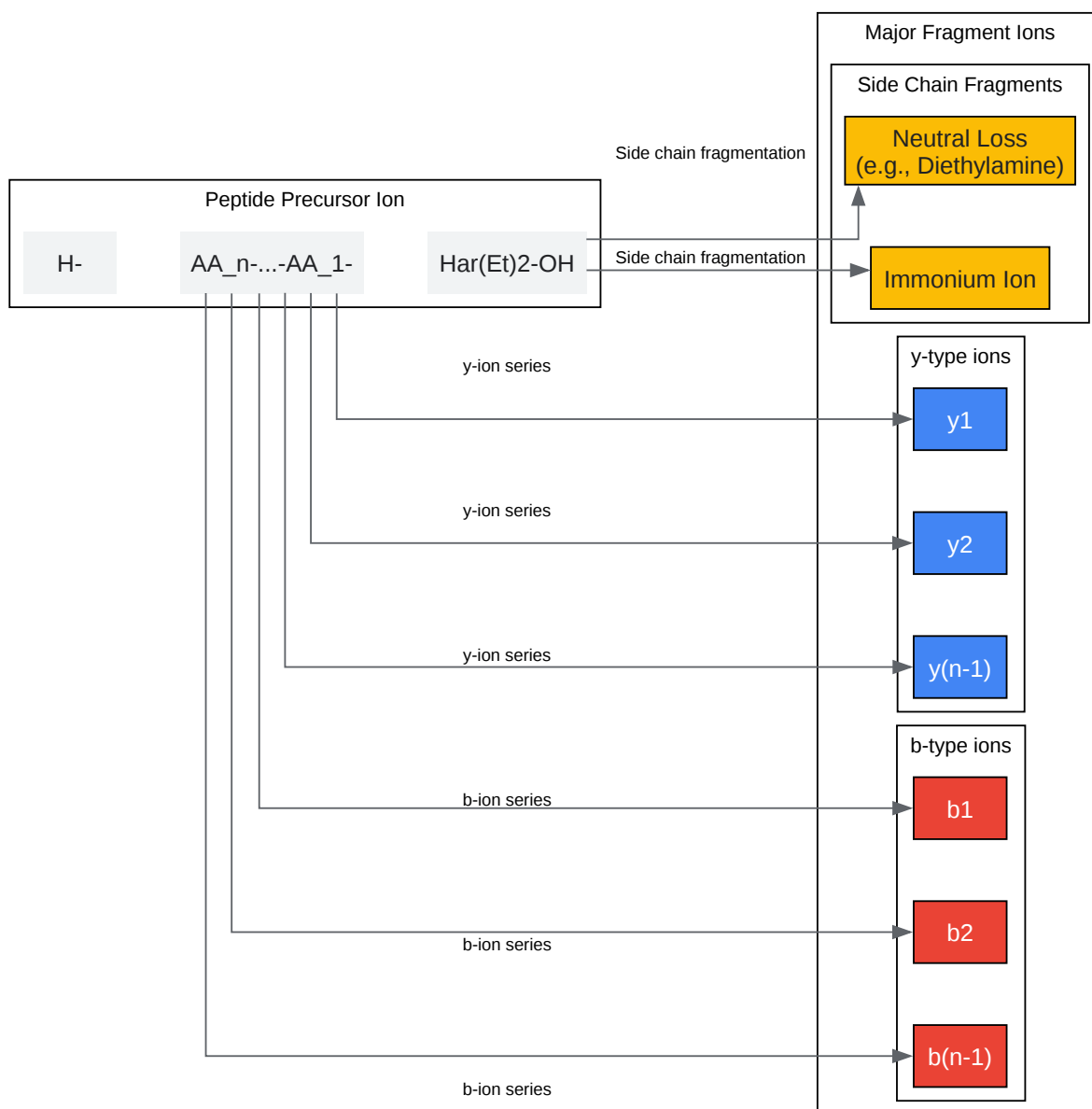
Predicted CID Fragmentation of a Peptide with C-terminal L-Homoarginine(Et) 2

Click to download full resolution via product page